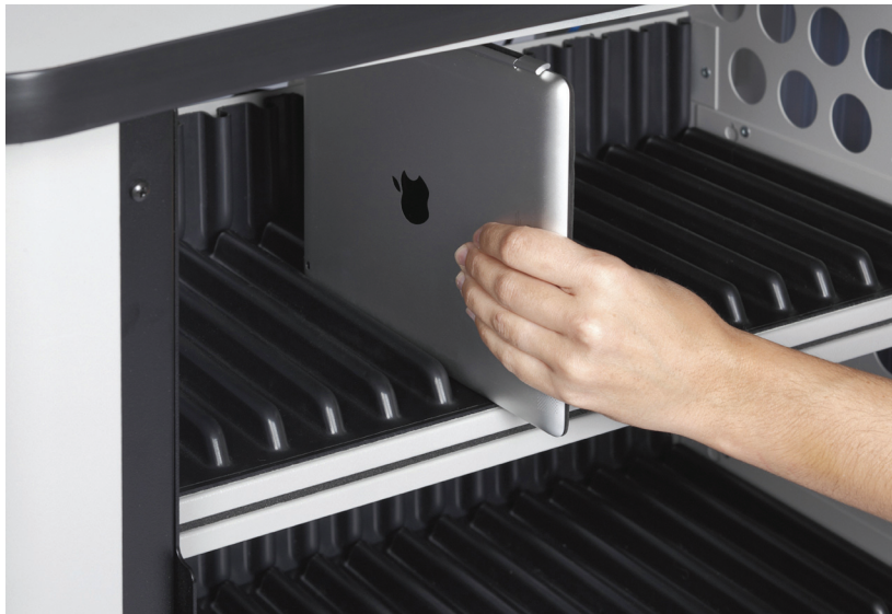
Figure 3-1. Sliding an iPad into a tray in the cart.

STEP 4: Now that each iPad is configured, slide the iPads into the trays within the cart, as shown in Figure 3-1.